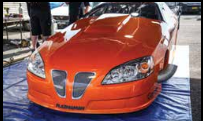
Bennett Motorsports, Pontiac GXP, 427 LS, Twin-turbo. Fastest LS powered vehicle in the Southern Hemisphere